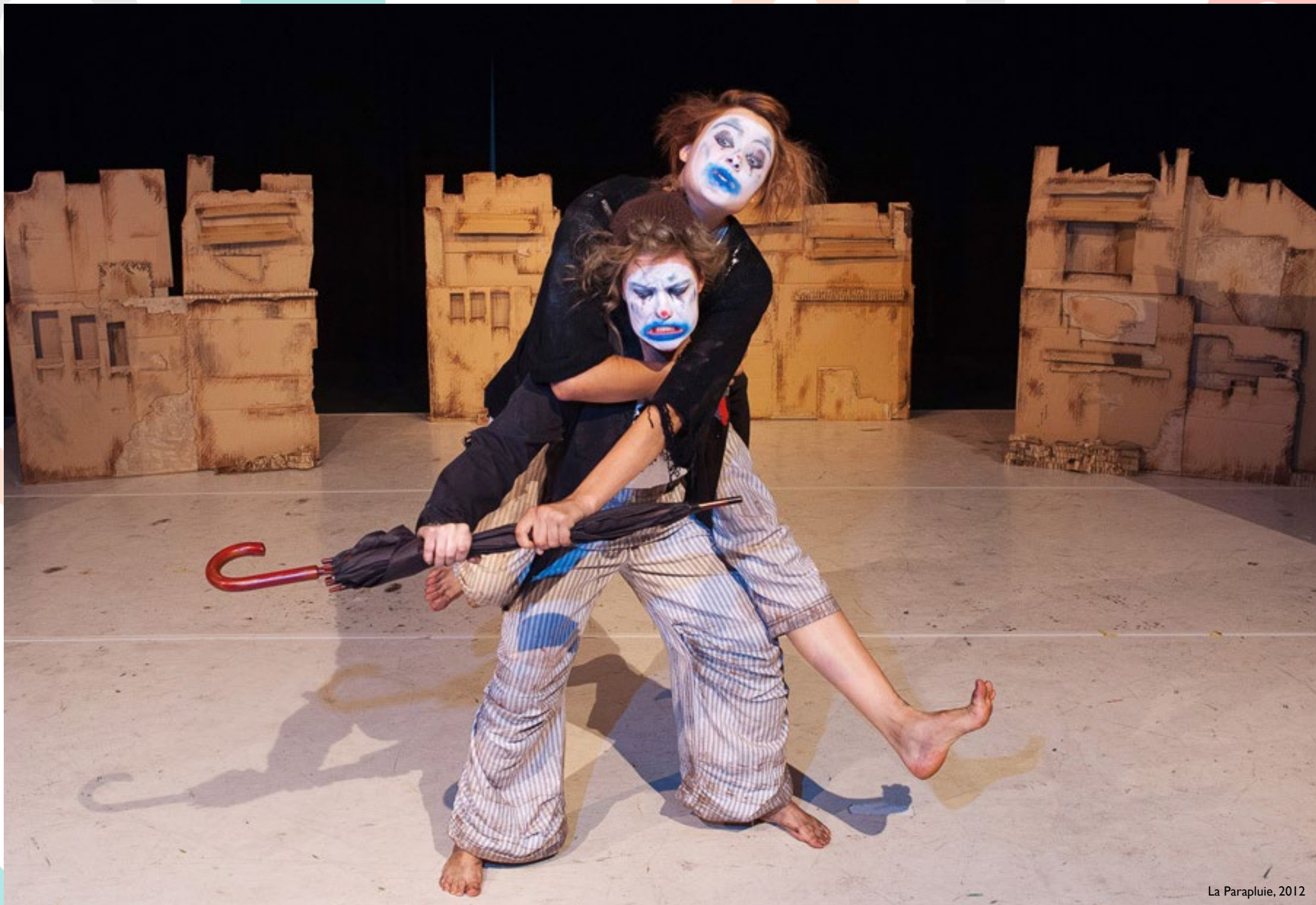
La Parapluie, 2012