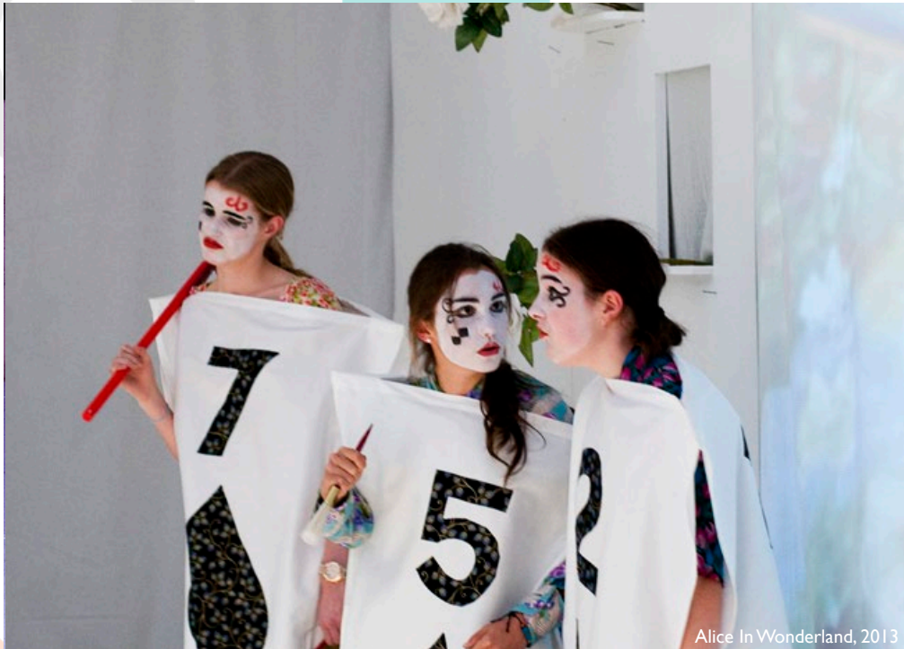
Alice In Wonderland, 2013