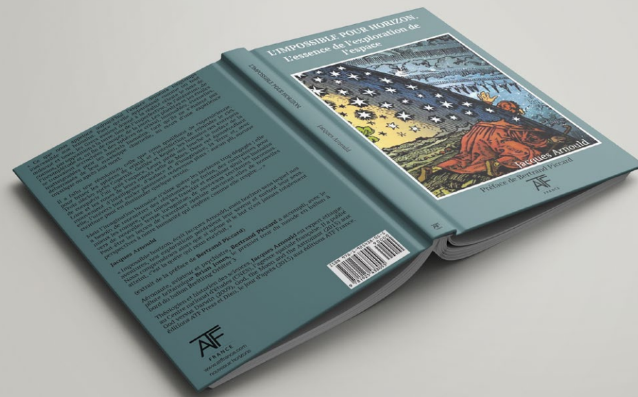
L'Impossible Pour Horizon, 2018