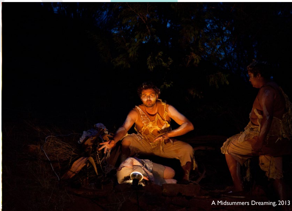
A Midsummers Dreaming, 2013