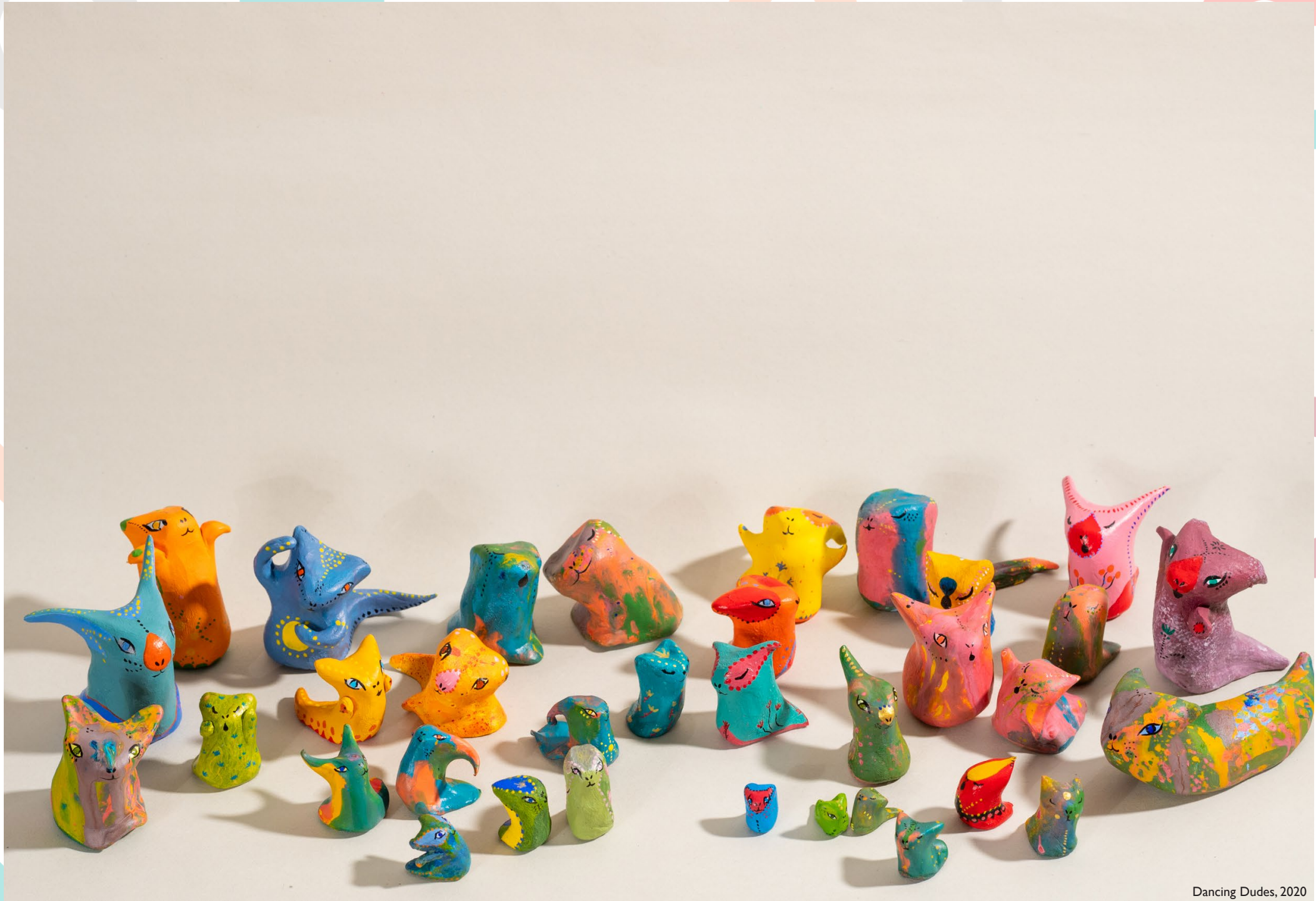
Dancing Dudes, 2020