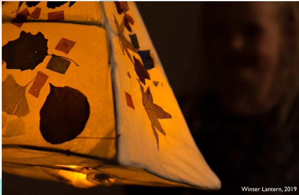
Winter Lantern, 2019