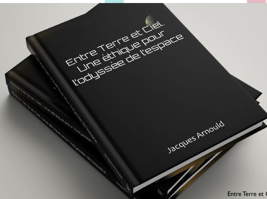
Entre Terre et Ciel, 2018

I design book covers and marketing material in consultation with this international publisher. My outstanding creative and technical skills and a fine attention to detail are key to my success in this role.