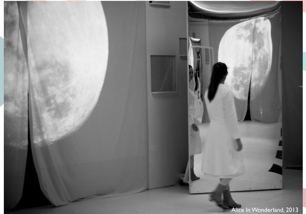
Alice In Wonderland, 2013