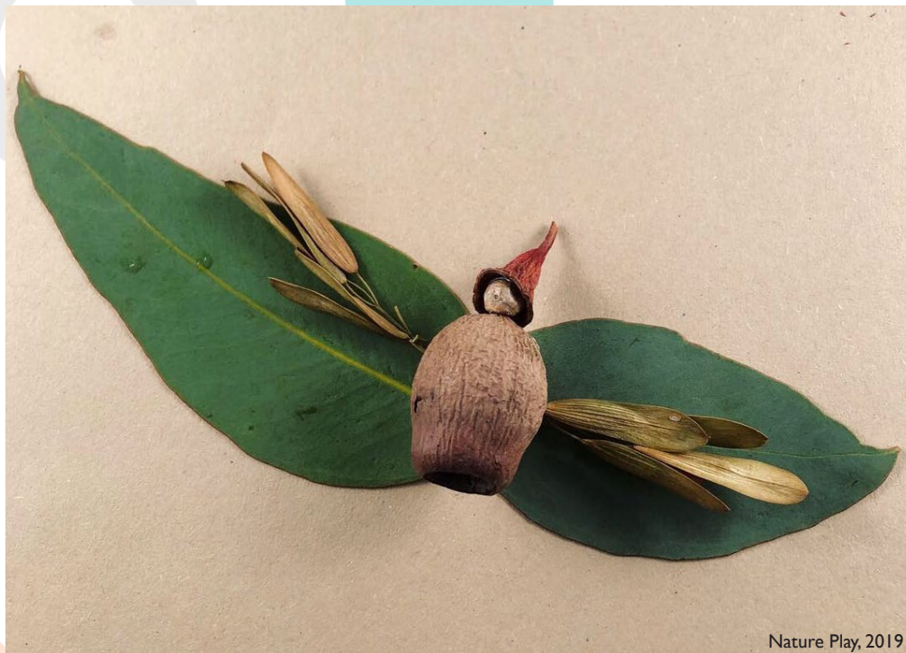
Nature Play, 2019