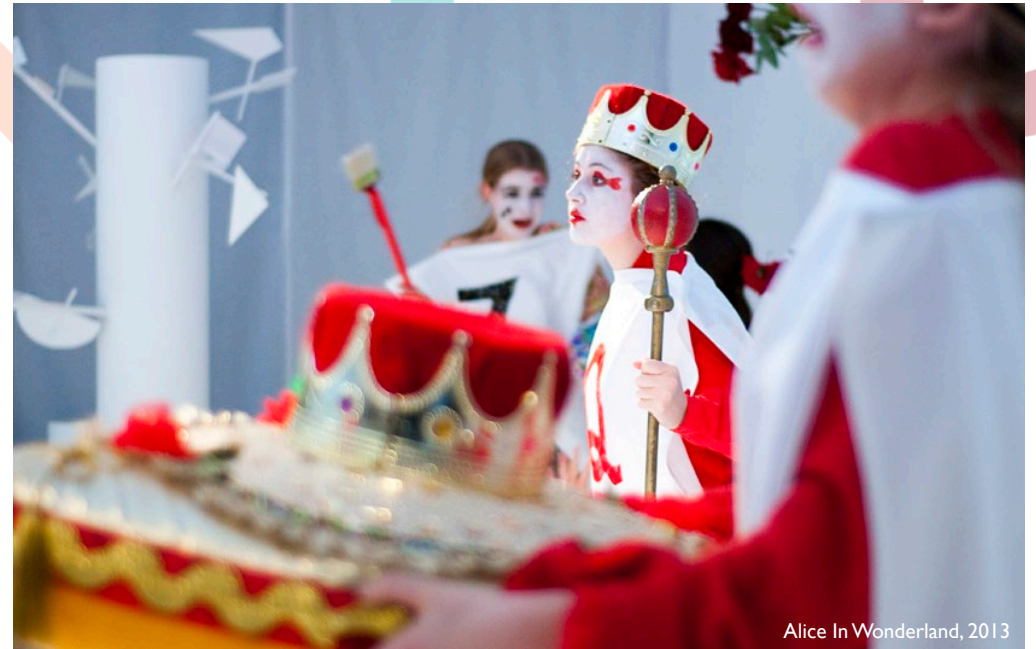
Alice In Wonderland, 2013

Alice in Wonderland was a complex and wild experience to design. My involvement saw me working from concept through to painting and assisting in the construction. The play had so many surreal settings, that the overall design became very abstract and transformed with lighting and projections. Just like the story, it was an exciting ride to be part of with the students.