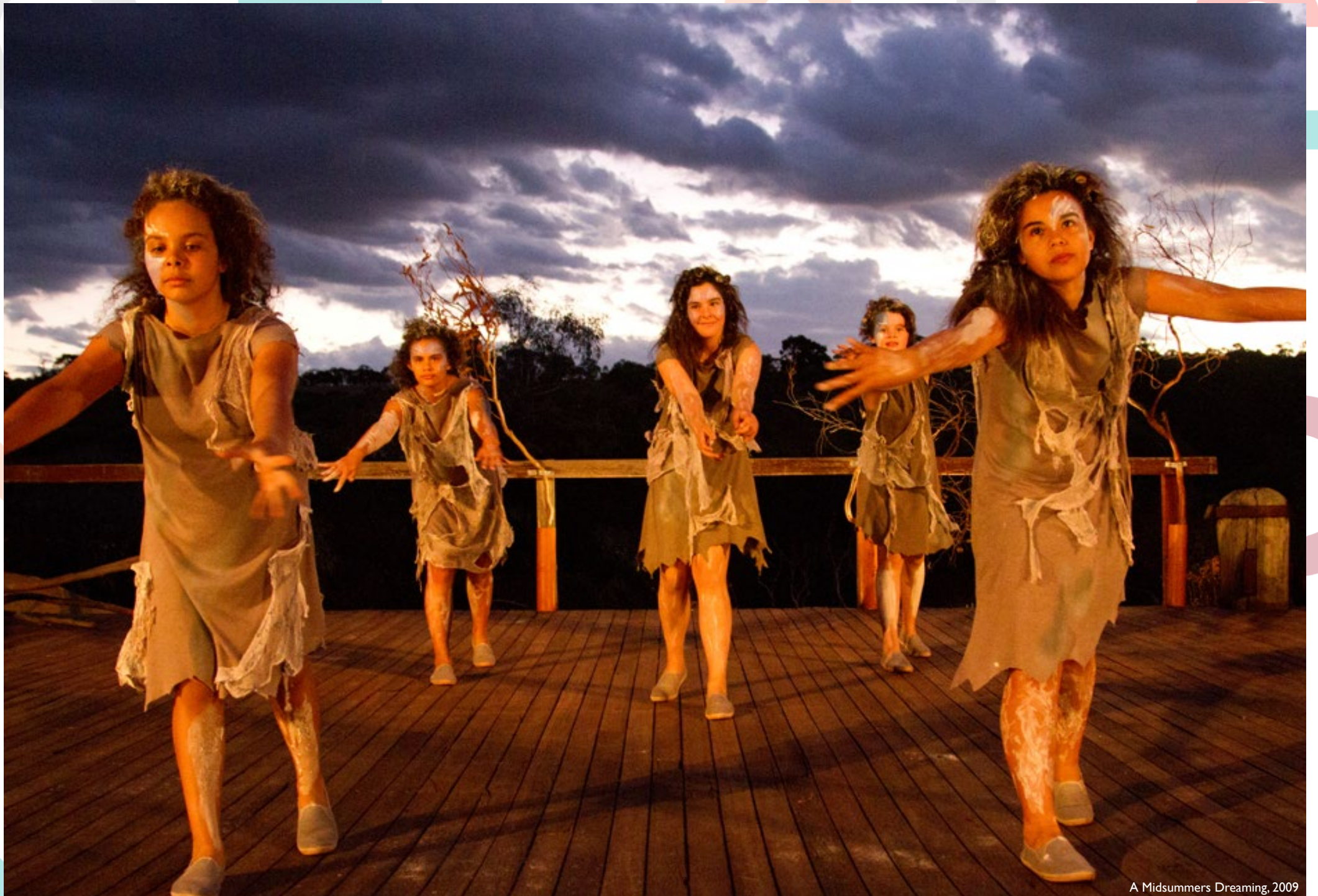
A Midsummers Dreaming, 2009