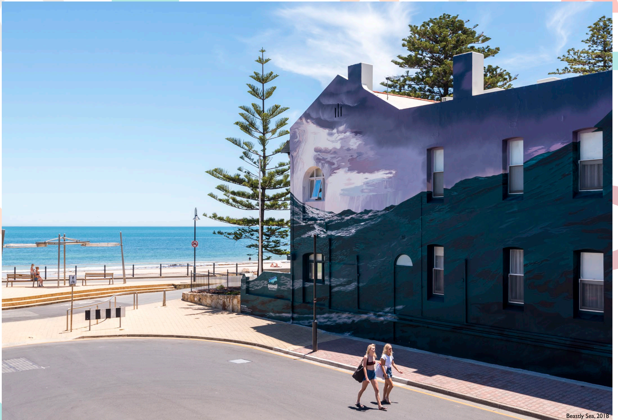
Beastly Sea, 2018