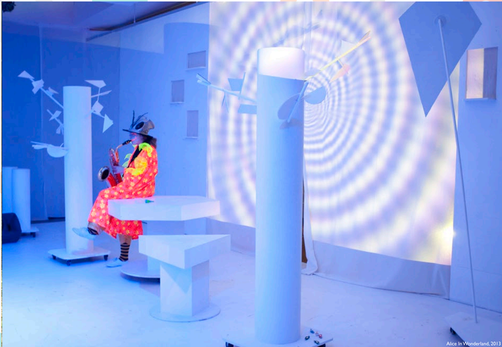
Alice In Wonderland, 2013