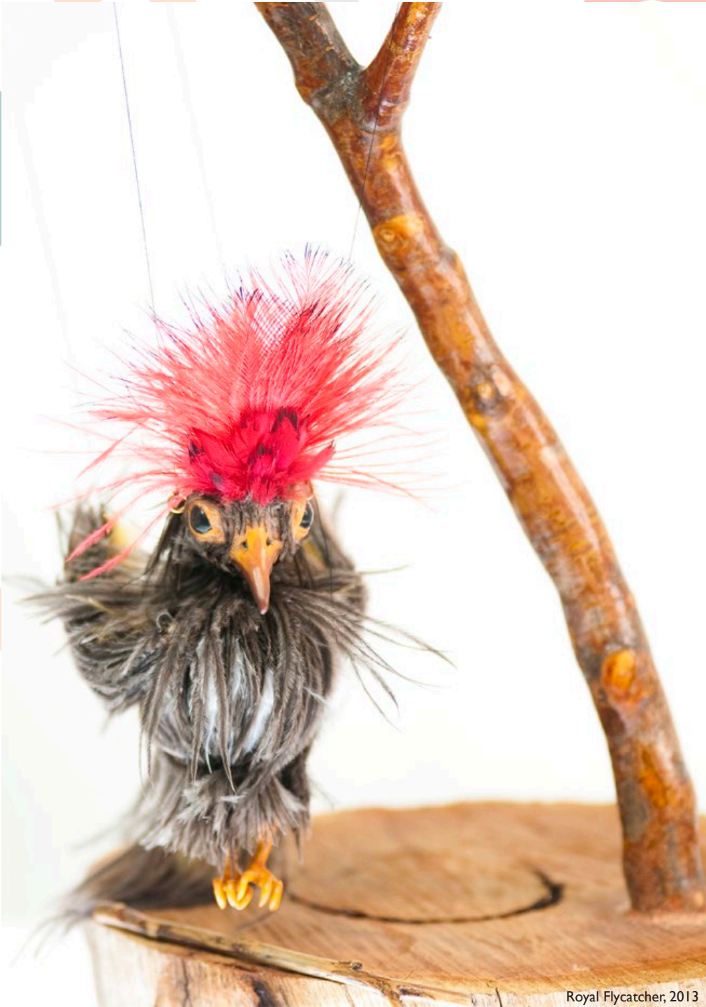
Royal Flycatcher, 2013

With their imaginative potential and the immediate attraction for play, puppets have always fascinated me. I enjoy exploring different materials, learning new processes and the ways a variety of materials can produce different results and ideas. This is a self taught skill, fostered by observation, discovering the ways movement and expression are produced.