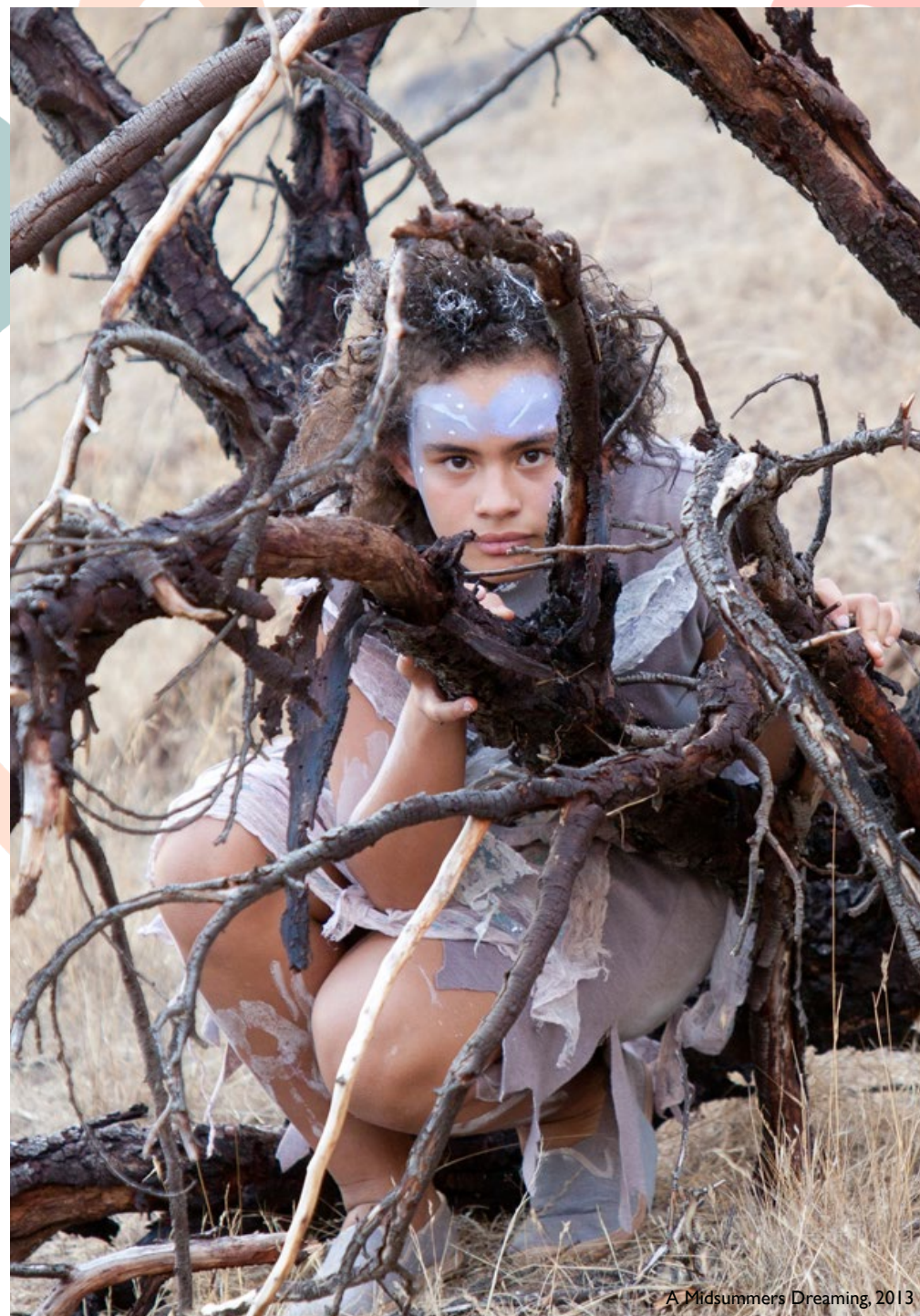
A Midsummers Dreaming, 2013

A Midsummer Dreaming was a privilege to work on, with a new landscape and communities. The set design was minimal due to the venue being outdoors in the hills of South Australia, on the Gibberagunyah Amphitheatre. The costumes were a pleasure to design and create, drawing on the Australian landscape for inspiration.